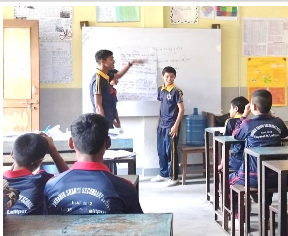
weMEN Club Session at Shramik Shanti Sec. School