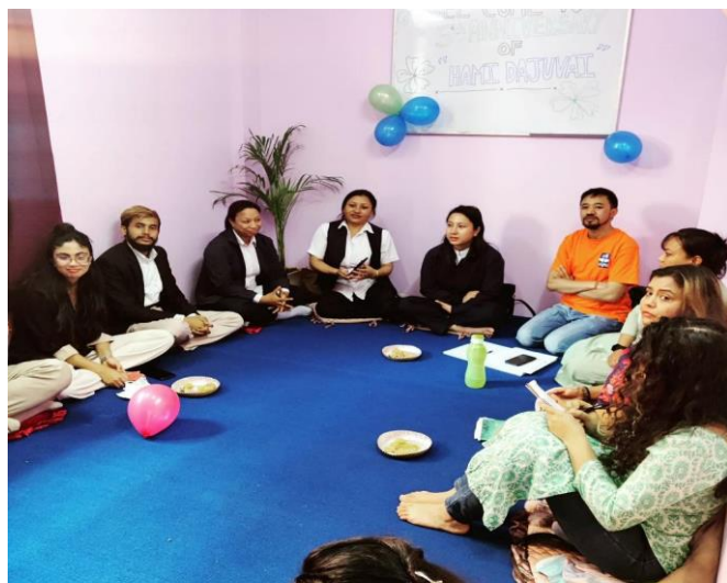
Representative from SWD, LMC and others in 5th Anniversary of HDV and Launch of Resource Center