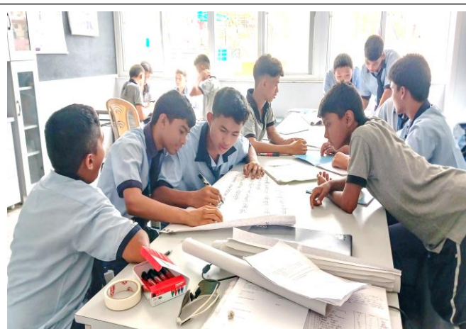
weMEN Club Session at Nirmal Sec. School