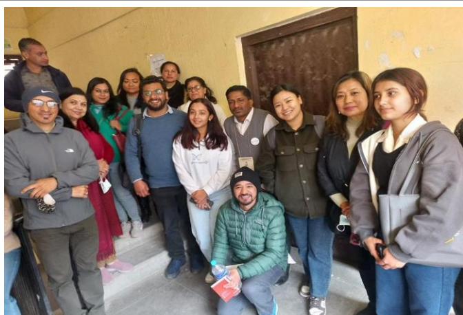
World Social Forum 2024- After session