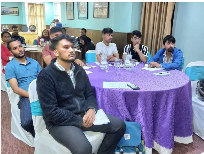
Participants in VAB Network commencement held at Alpha House