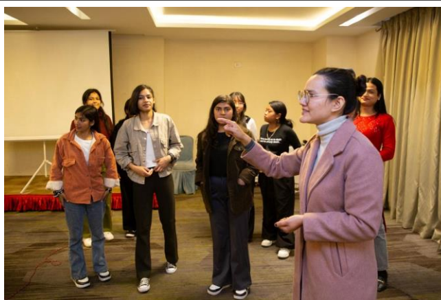
Facilitating Youth Workshop - Margin to Centre