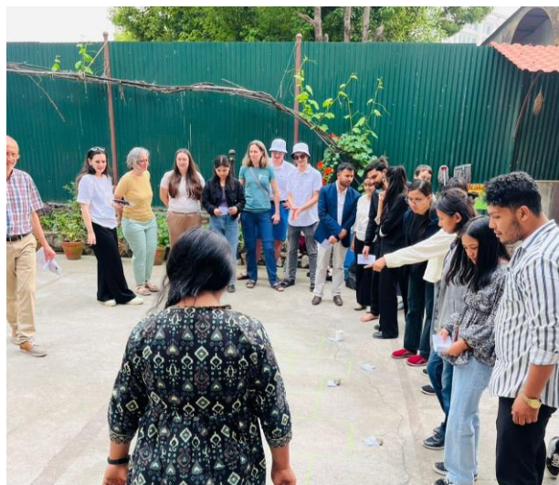
HDV staff and members with DKA visitors and other partner members