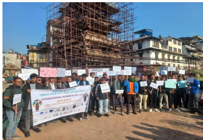
Men's March on occasion of International Women's Day 2024