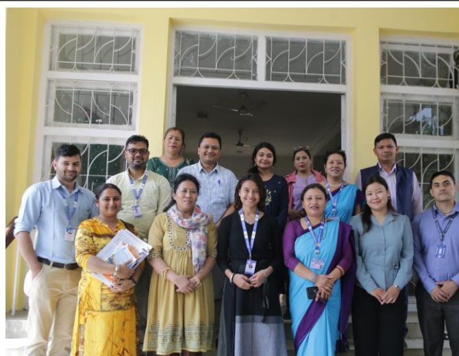
Child Labor Day 2024- After Session