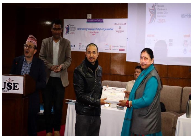
Handing Appreciation Certificate on - National conference of child Club Graduates 2023