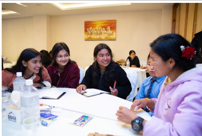
Group work on youth workshop - Margin to Centre