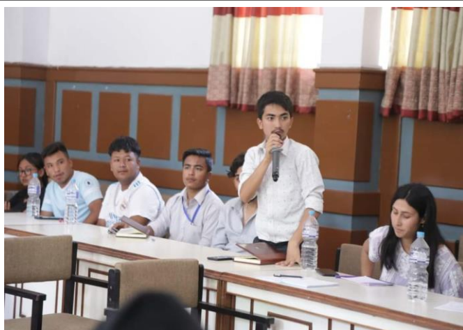
Facilitator of weMEN Club sharing some insights in Chil labor event.